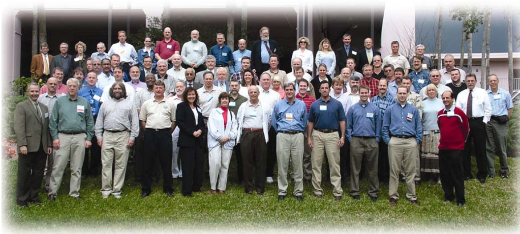
State Regulators and Captains of Industry Conference Attendees, 2004